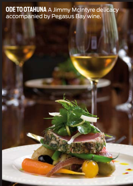
ODE TO OTAHUNA A Jimmy McIntyre delicacy accompanied by Pegasus Bay wine.