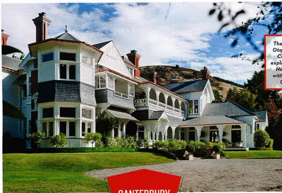
The exterior of Otahuna; Black Cat Cruises exploring Akaroa Harbor; tuna with avocado at Otahuna.