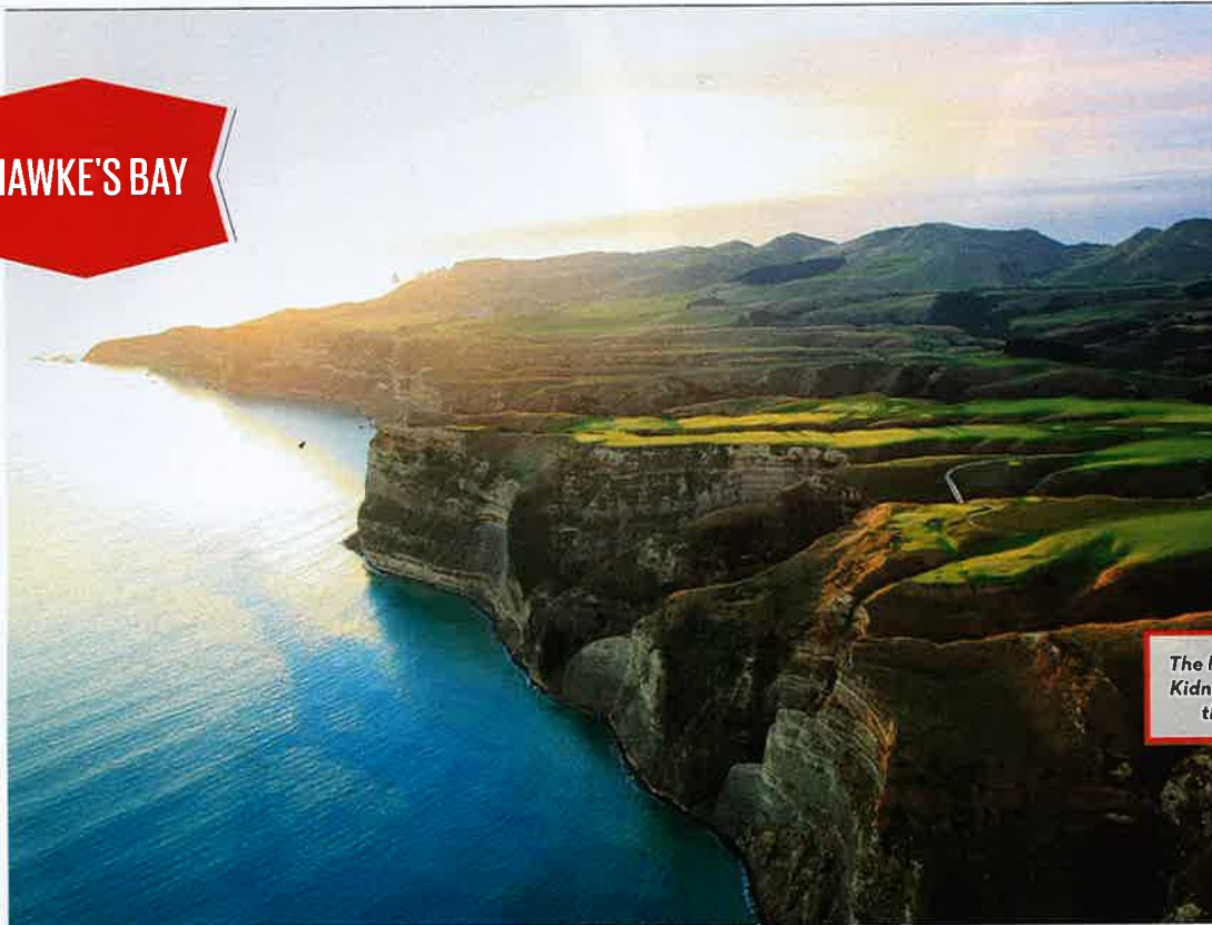
The Farm at Cape Kidnappers along the Pacific

see the rare creatures on a guided walk that involves tracking the birds, which are equipped with transmitters.