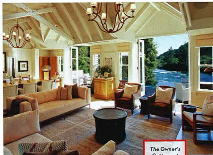
The Owner's Cottage at Huka Lodge

While in the area, visitors can try some of the region's other top activities, including Volcanic Air Helicopters & Floatplanes (64-7/348-9984; volcanicair.co.nz) heli trip to New Zealand's most active volcano, White Island; sailing on Pure Cruise's (64-7/362-8048; purecruise.co.nz) 53-foot catamaran on Lake Rotoiti; Foris Eco-Tours (64-7/542-5080; foris.co.nz) Whirinaki Forest walking tour; and anything organized by Multi-Day Adventures (64-7/348-4290; multidayadventures.co.nz)—rafting, mountain biking, kayaking, rock climbing, you name it.