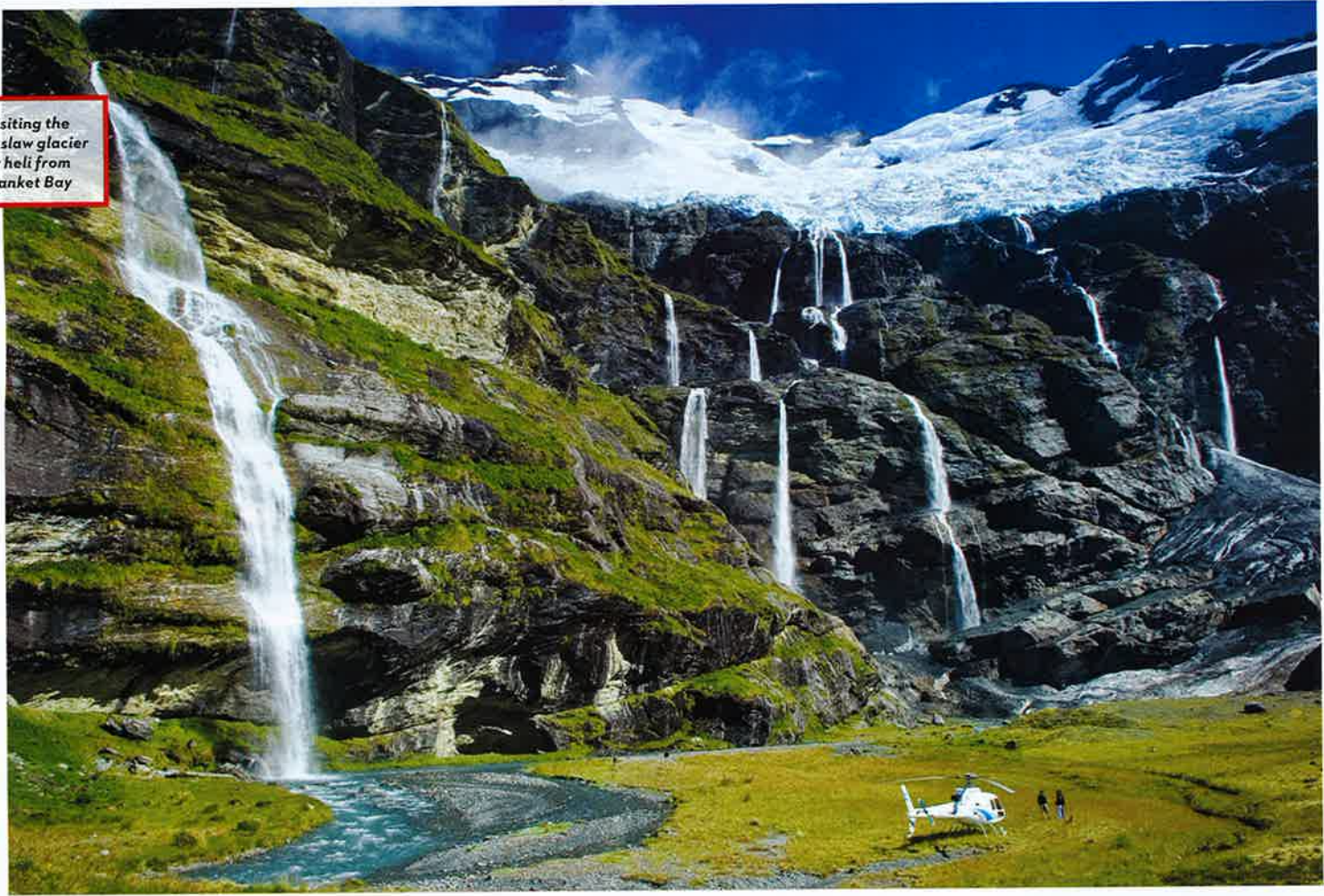
Visiting the Earnslaw glacier by heli from Blanket Bay