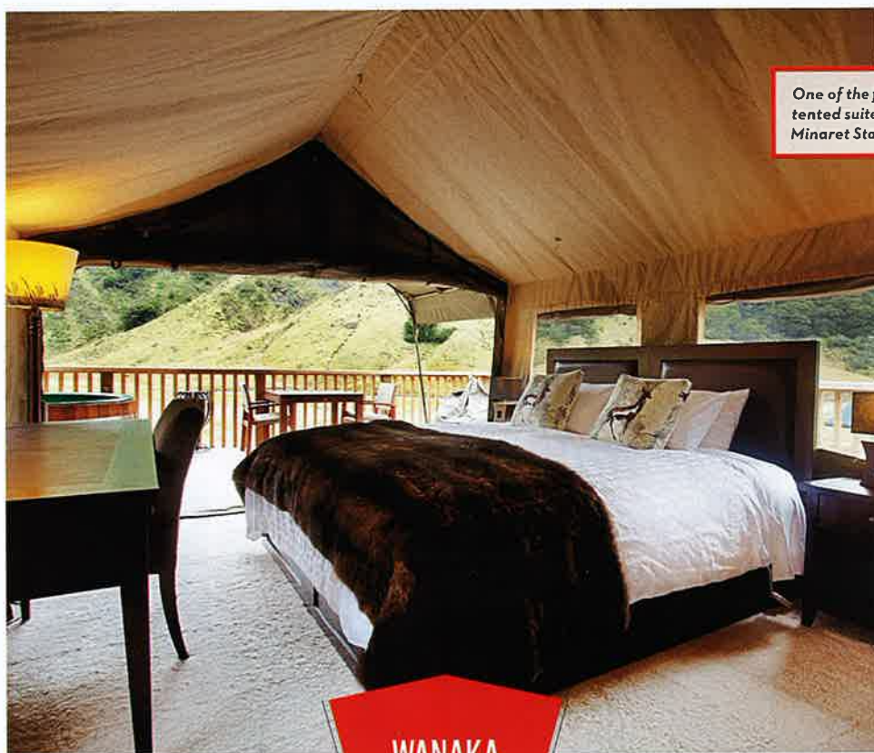
One of the four tented suites at Minaret Station