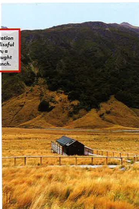
Minaret Station provides blissful isolation; a freshly caught lobster lunch.

Dinner is a blast; Wallis and Shirl are a riot, telling tales about family weddings, Christmases and marriage proposals. Appetizers are lobster leg, tempura shrimp and fish with soy sauce. For dinner, it's broccoli soup (with lobster), venison and sponge cake. After our last laugh, Shirl gives me a flashlight and