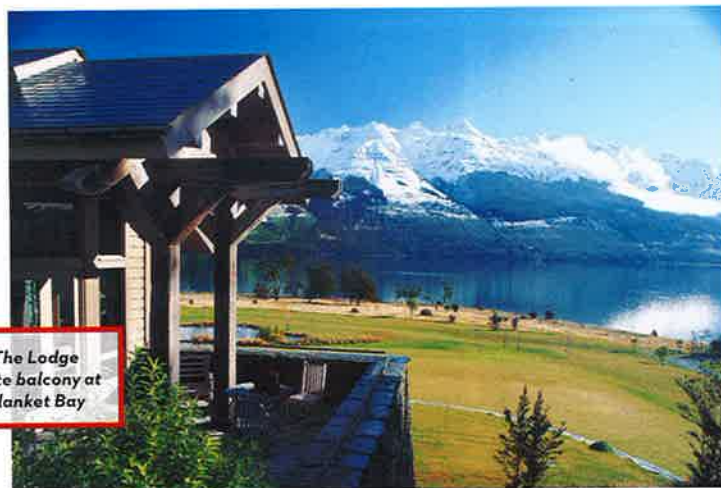
The Lodge Suite balcony at Blanket Bay

The activities in Queenstown are as gripping as the landscape, as the alpine village has built itself up as an adventure hub. Bungee