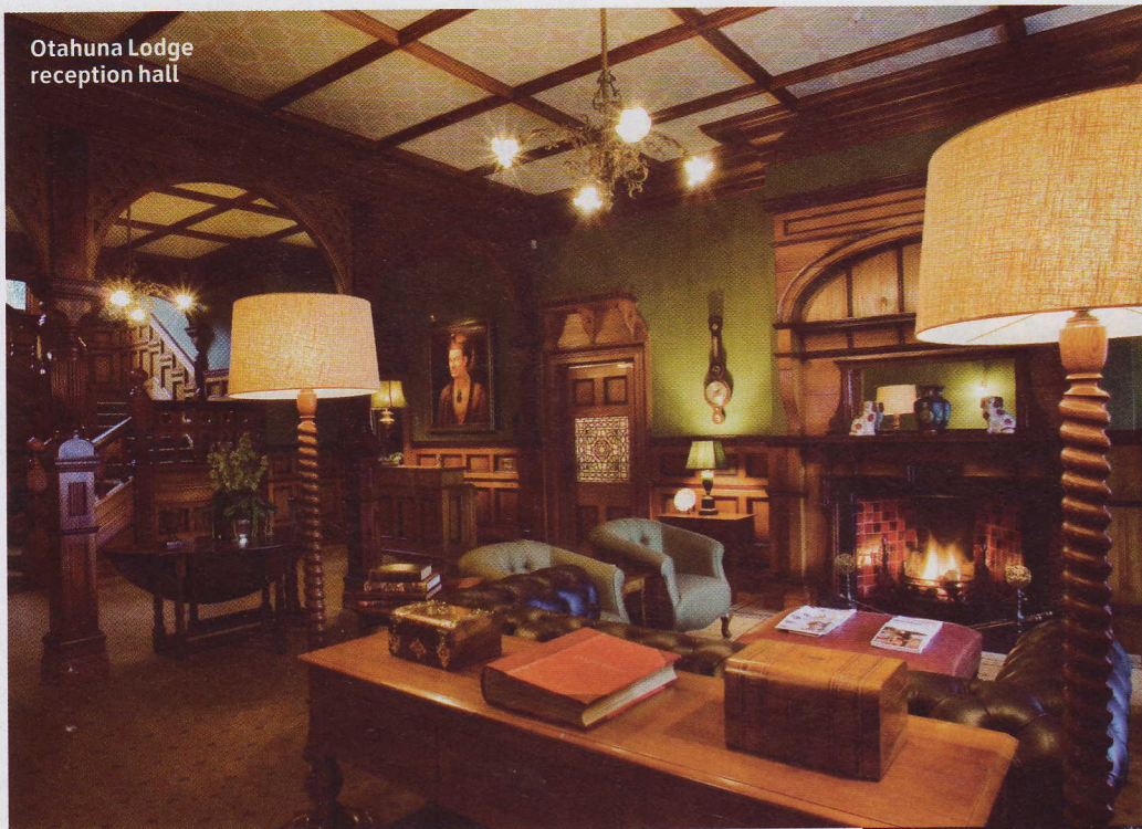
Otahuna Lodge reception hall