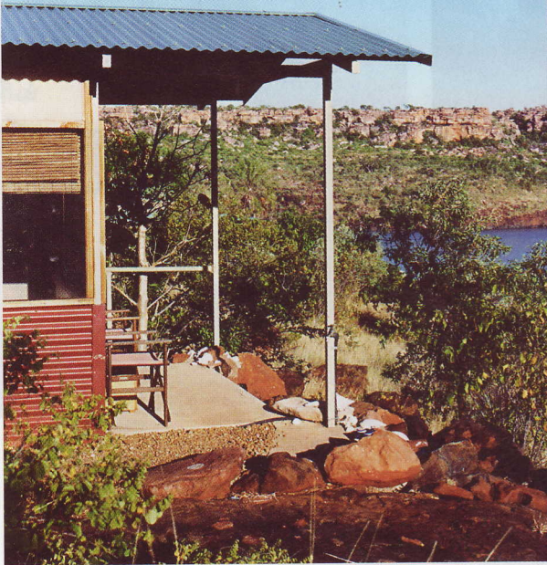
The Bush Camp Faraway Bay