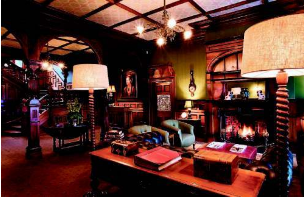
Blooming marvel ... (from left) springtime daffodils in the grounds of Otahuna Lodge; works by New Zealand artists hang in the entry hall; the Clark suite.