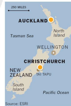
Los Angeles Times