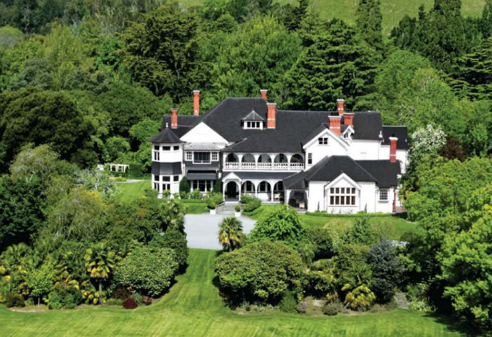
Otahuna Lodge, a Relais & Châteaux, offers a refined and customized New Zealand lodge experience.