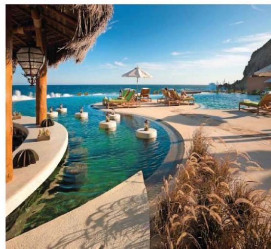
Couples can relax together at the infinity edge pool at Capella Pedregal.

PACKAGE DEAL The four-night Romance Under the Stars package includes a daily breakfast spread, round-trip airport transfers and swoon-worthy extras (a couple's spa treatment, private dinner on the beach and more). Low-season rates start at $785 per night, capellahotels.com