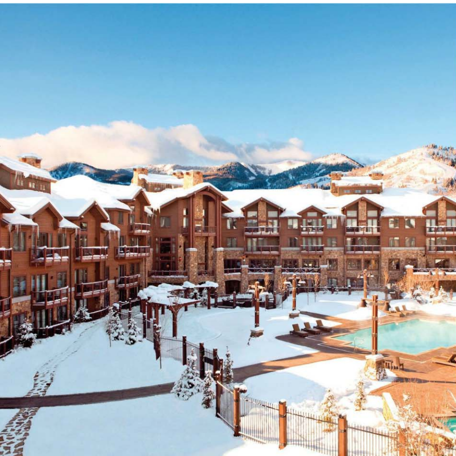
Slopeside at the Canyons Resort is the Waldorf Astoria Park City—the ideal locale for year-round outdoor activities.

PACKAGE DEAL Take pleasure in the two-night Couples Retreat package, offering sparkling wine upon arrival, a 50-minute couples massage, rose-petal turndown and a $50 breakfast-in-bed reward credit each morning. In summer, stay in a standard guest room for $389 or a standard one-bedroom guest residence for $669; winter retreats start at $829 for a standard guest room and $1,109 for a one-bedroom guest residence. Additional nights can be easily added: Summer starting rates are $209 for a standard guest room and $489 for a one-bedroom guest residence; winter starting rates are $649 for a standard guest room and $929 for a one-bedroom guest residence. parkcitywaldorfastoria.com