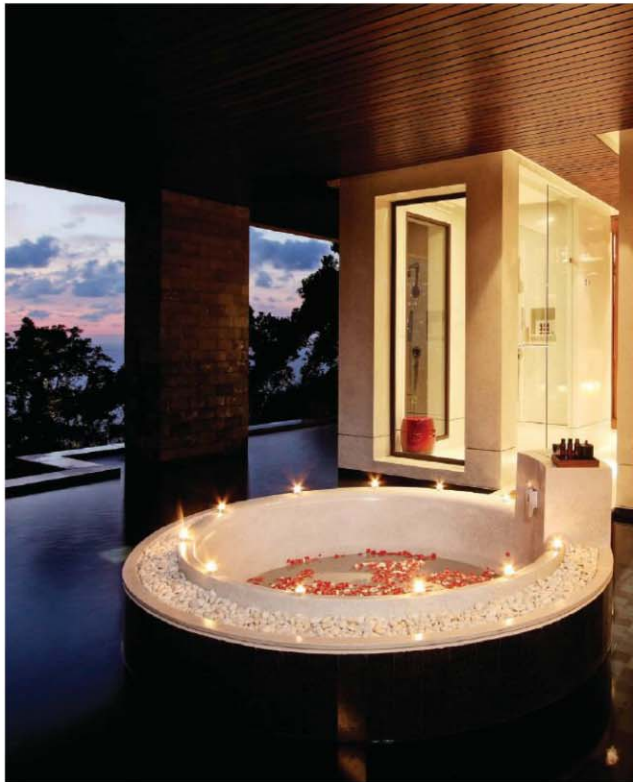
Dramatic views are the norm from the water-surrounded island bathroom with huge floating tub in the Dima Spa Suite.