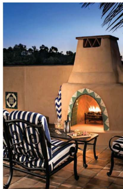
Enjoy sitting out on this private Casita patio in the evening—just you and your honey.