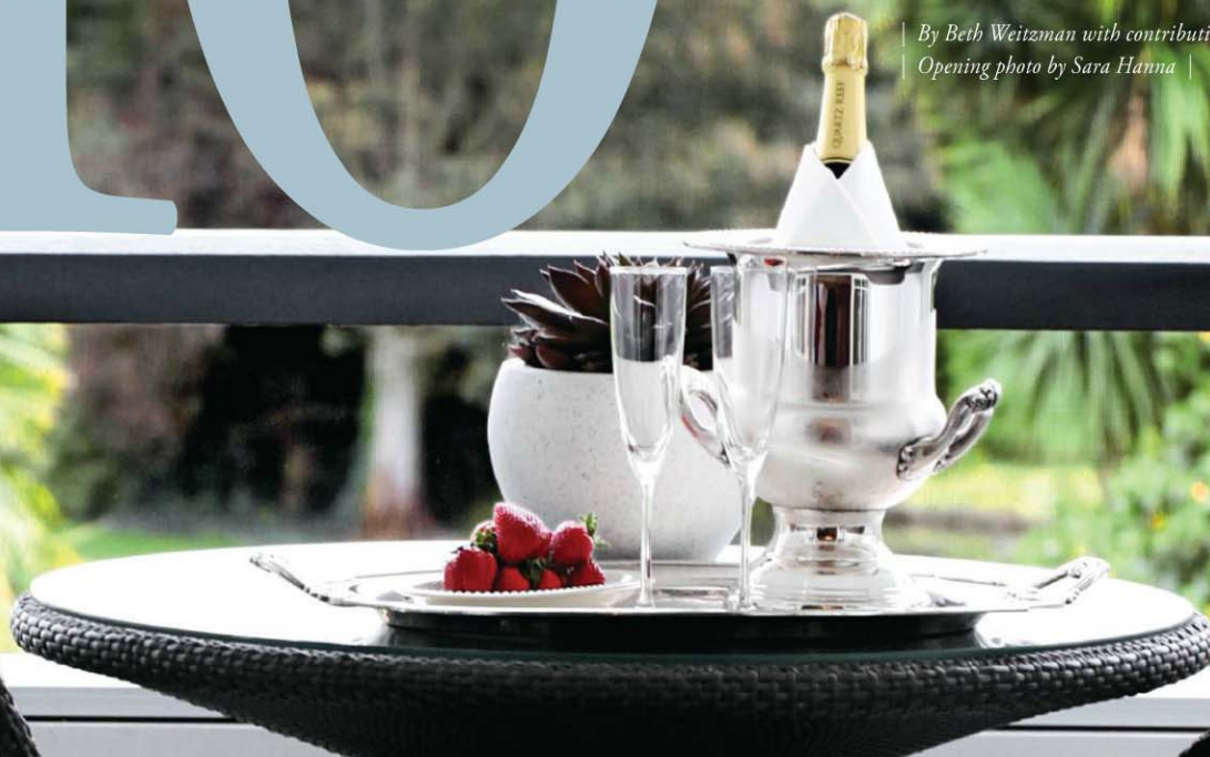
Champagne and strawberries on the porch of the Rhodes Suite, one of two grand master suites, at the Otahuna Lodge