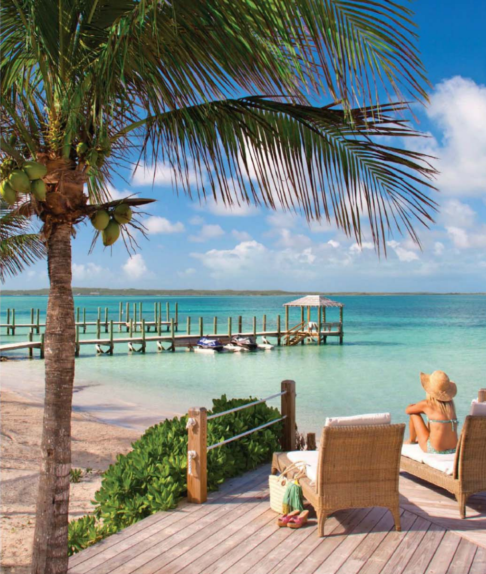
Three Bees is the only villa property on Harbour Island to have a beach on the bayside of the island, and a private one at that.