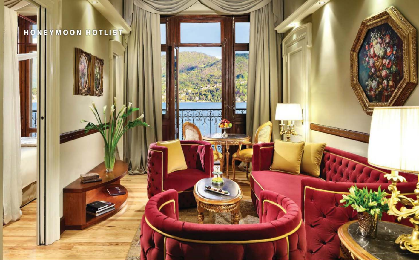
Charm and romance were the design inspiration for the luxurious Honeymoon Suite Maria.