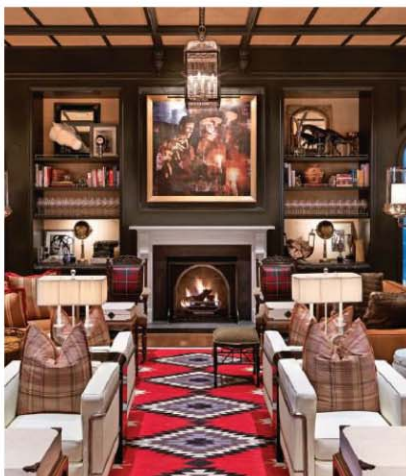
The new Living Room is the perfect spot for mixing and mingling with other hotel guests and locals alike.

PACKAGE DEAL Honeymooning is la dolce vita, where a three-night (or longer) stay in luxury accommodations is just the beginning. Daily breakfast, a candlelit dinner for two at La Terrazza in view of magical pink vistas playing off Lake Como, and a tour of its touted waters aboard the Venetian lancia are also included. Awaiting your arrival is sparkling Spumante with a complement of strawberries and chocolate. Honeymoon packages start from $1,510 per night, grandhoteltremezzo.com